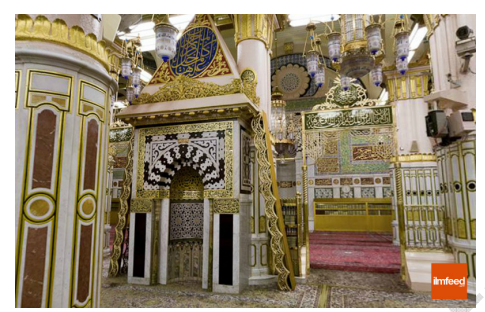
Figure 10 Ustuwana Hunana

This is behind the Mihrāb of the Prophet (peace and blessings of Allāh be upon him). It was built at the place of the weeping tree stump, which the Prophet (peace and blessings of Allāh be upon him) used to use as a Minbar before one was formally built for him.