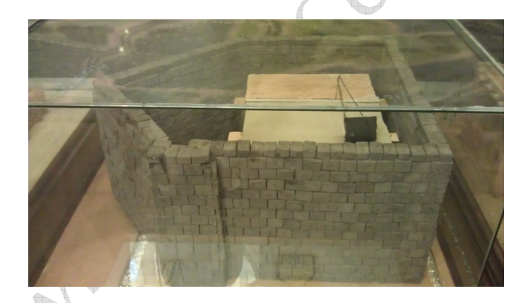
Figure 7 Umar ibn Abd al-Azīz added these five walls around the Secret Chamber.

There were no doors so the chamber was completely sealed.