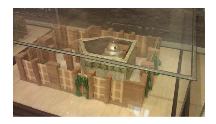
Figure 8 A silver dome was placed above the Prophet's final resting place.