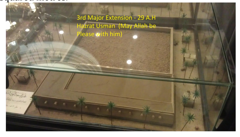
Figure 3 This was the last time the mosque was extended from the south side.

Sayyiduna Uthmān (may Allāh be pleased with him) personally took part in the work. Now the area of the mosque was 5061 squared metres.