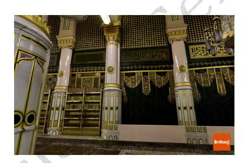
Figure 14 Left pillar: Wufud, middle pillar, Ali and right pillar, sarir.

This is the place where delegations would meet and converse with the Prophet (peace and blessings of Allāh be upon him).