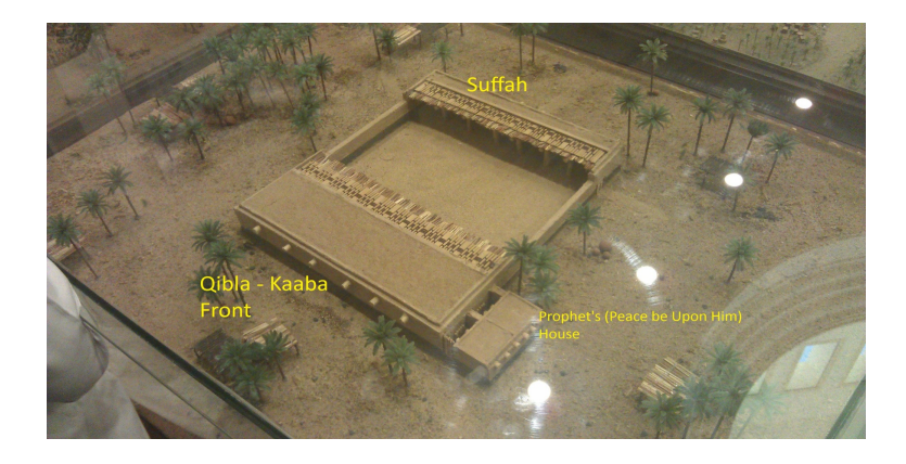
Figure 2 The direction of prayer was now towards Makka and Suffa was moved to the back.