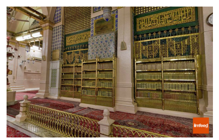
Figure 13 Ustuwana Sarir.

It is reported that the Prophet (peace and blessings of Allāh be upon him) used to sit I'tikāf here and would sleep there too during it.