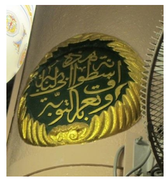
Figure 12 Ustuwana Abū Lubaba

This is the place where Abū Lubāba tied himself to after accidentally spilling a secret to Banū Quraydha.