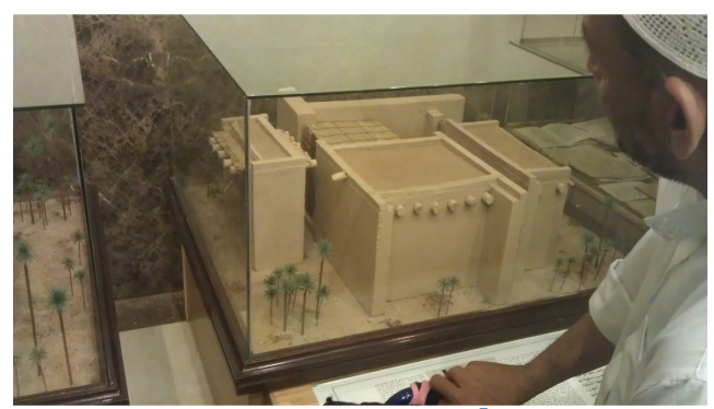
Figure 6 The Chamber of A'isha

It is worthy of mention that when Ā'isha used to do Ziyāra when the Prophet (peace and blessings of Allāh be upon him) and Abū Bakr were buried in her room, she sometimes did not cover her head. But when Umar was added (a non-Mahram), she would always cover her head.