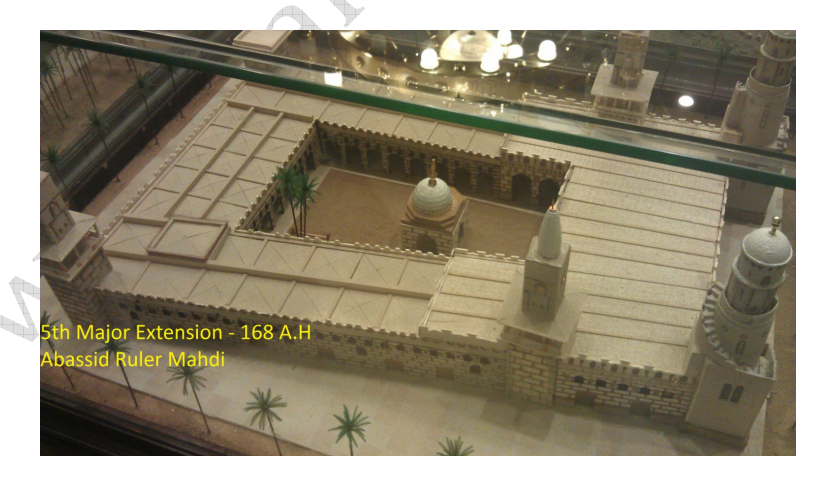
Figure\ 5\ A\ water\ fountain\ for\ ablution\ was\ added\ in\ the\ courty ard\ too.

In 168 AH, the Abbasid ruler Mahdī extended the mosque from the north side (back), and they added a shaded area for the first row.