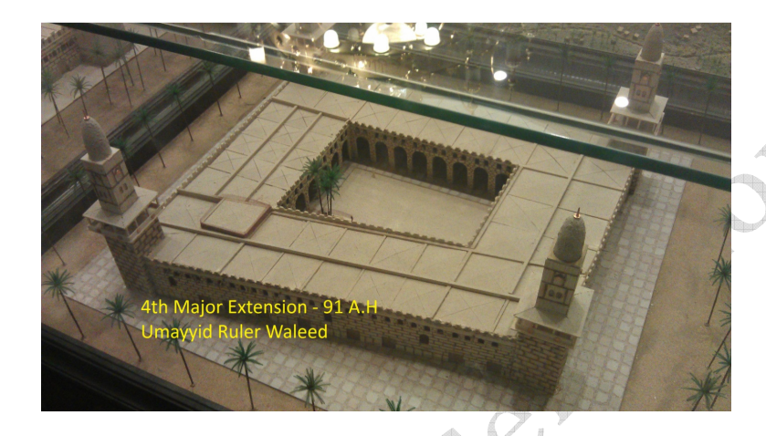
Figure 4 At the end of the first Islamic Century, Minarets were added for the first time.

At the end of the first Islamic century, the Umayyads gave due consideration to the Prophet's mosque, most notably Walīd and Umar ibn Abd al-Azīz. For the first time, four minarets were added to the corners, each 27.5m high. The mosque now had twenty doors. Umar ibn Abd al-Azīz also built five cornered walls around the four inner walls of the sacred chamber (this will be shown later). It was done as such so it did not resemble the Ka'ba.